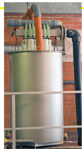
EFEKTYWNY™ Installed at Skurups Water

EFEKTYWNY™ is equipped with pipes, each of which can handle 5.5m 3 /h. The aerator tank can be made with 3 till 24 pipes which is an efficiency of between 16.5 - 132m 3 /h.