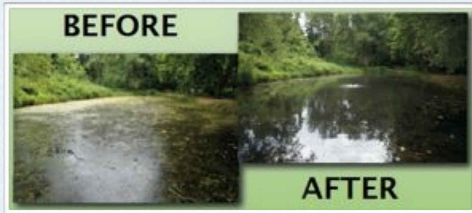
EffectiveNew™ at Fredrick County Maryland, US