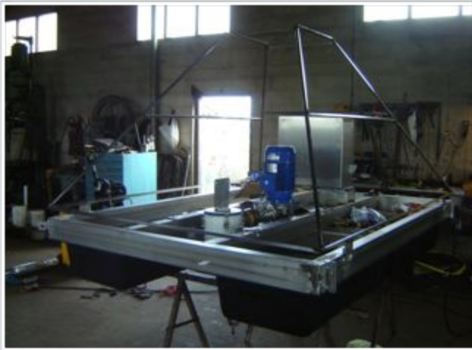
Production line: EffectiveNew™ 50m 3 /h placed on a raft