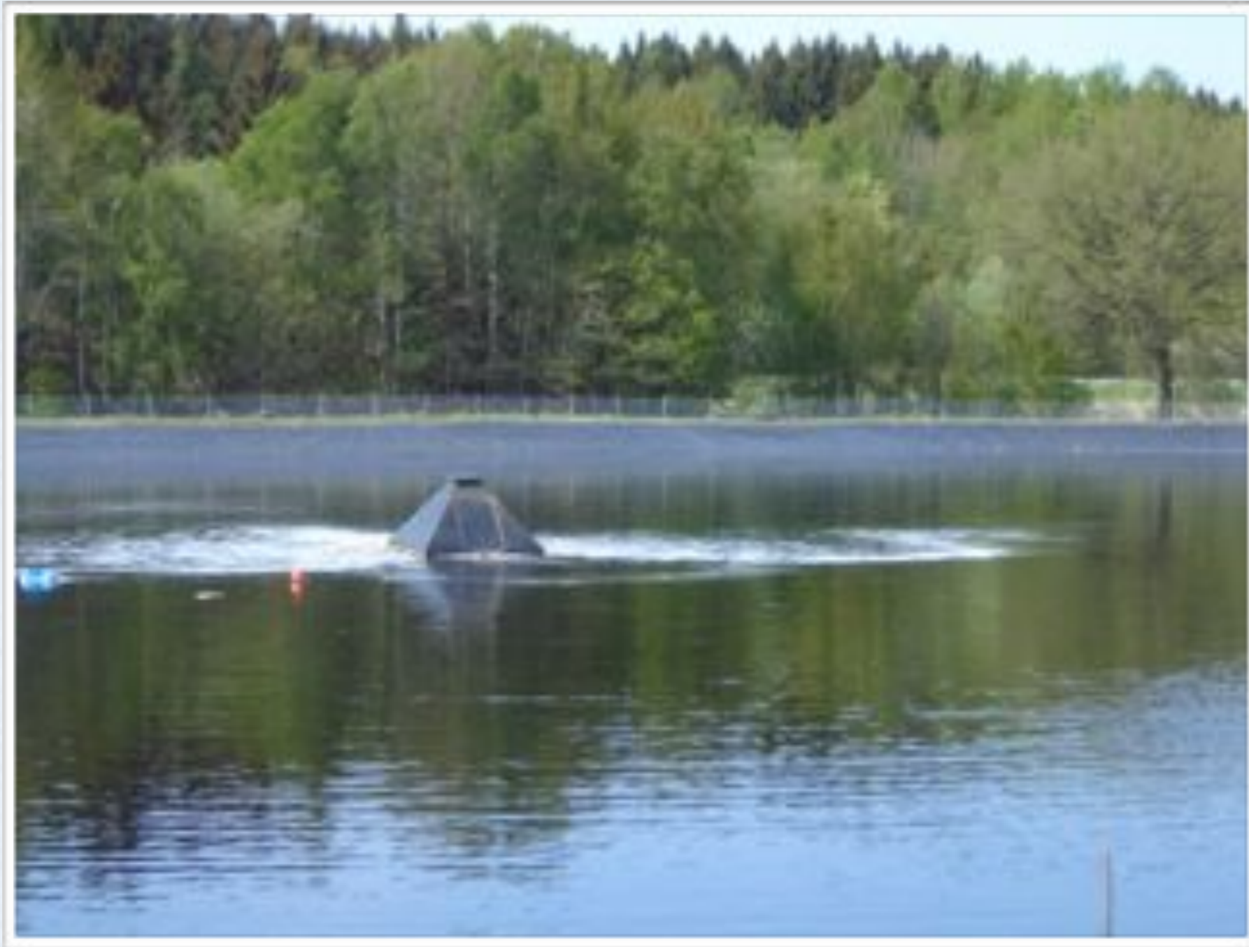
50m 3 /h aerator with a 4 kWh pump from ITT. The pond is 50,000m 3 .