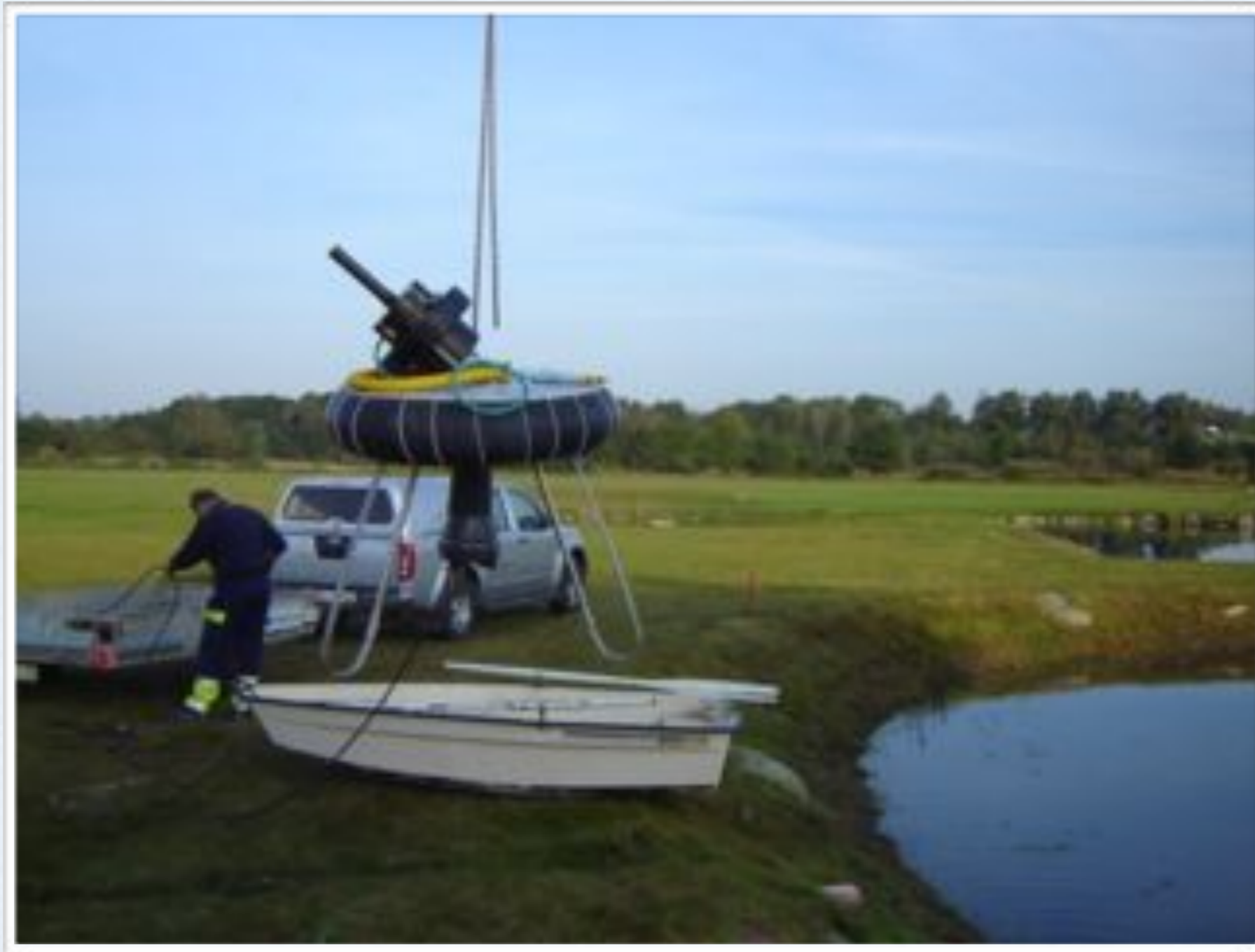
“Our invisible product” - shows the part that is under water. Malmö Stad, Sweden