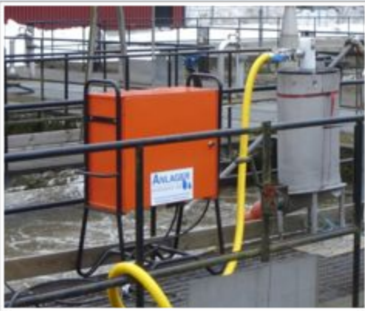
Test in sewage treatment plant