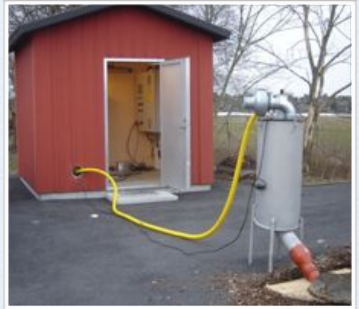
Test in pump station